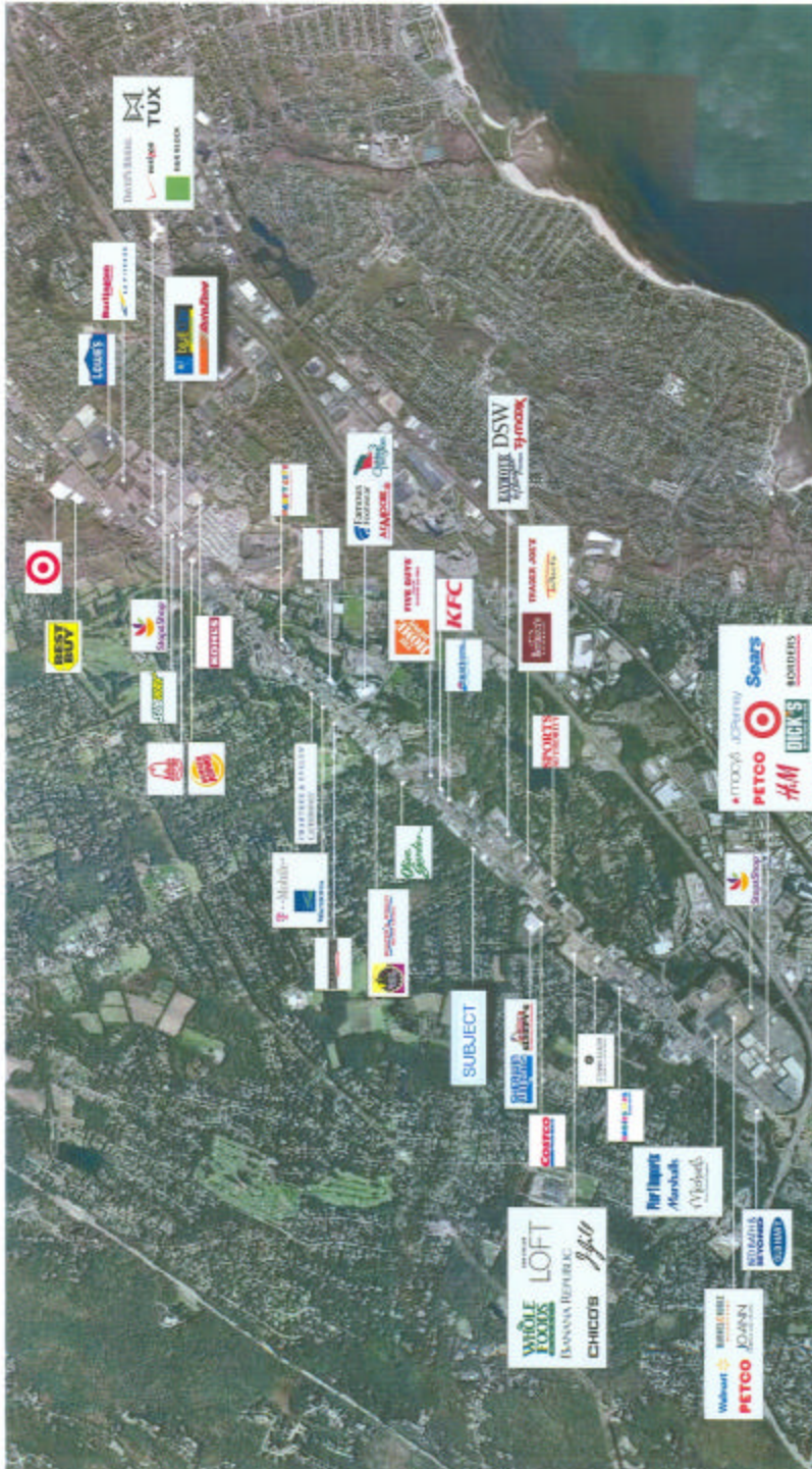
Boston Post Road Market | Orange, Connecticut