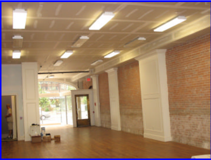
FIRST FLOOR RETAIL